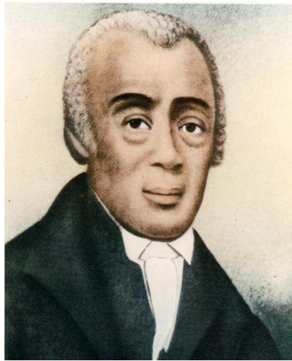
Bishop Richard Allen, Founder of the A.M.E. Church—Feb 1760-1831