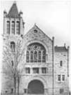
Mother Bethel African Methodist Episcopal Church, Philadelphia, PA