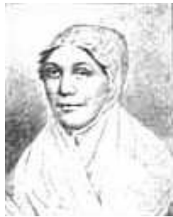
Bishop Richard Allen and wife, Sarah Allen